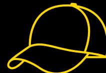
Gold Hat $1500