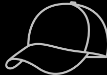
Silver Hat $1000