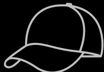
Platinum Hat $2000