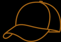
Bronze Hat $500

We have four tiers of sponsorship which we can tailor to your needs! Support students, gain visibility, and engage directly with the next generation of cyber professionals.